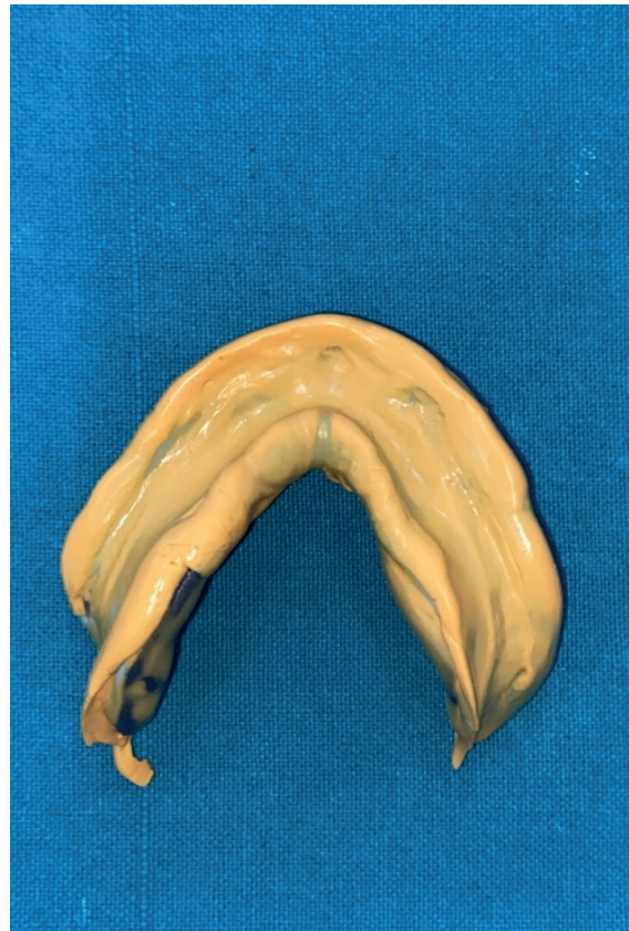
Figure 5: Wash impression made with polyvinyl siloxane light body consistency impression material.

The preliminary impression was created with polyvinyl siloxane impression material [18]. This material was chosen because it is simple to mix, is available in all four consistencies, has a high viscosity, can be poured up to a week later than usual, poured repeatedly, is easily adaptable and strengthened with metal mesh, and can reproduce excellent surface details [19]. The proposed material enables further extension to regions that the impression tray might not be able to sustain. Moreover, it provides a longer and more satisfactory working period of about 4 – 6 minutes [20], which gives the dental surgeon more time to cover all the lingual, buccal, and labial flange areas.