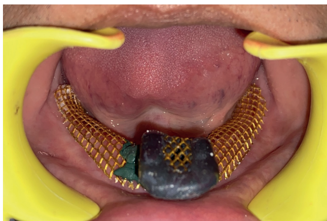
Figure 2: Custom preliminary impression tray in patient's mouth.