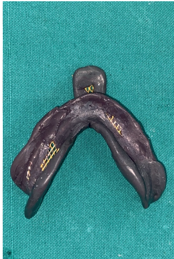
Figure 3: Mesh outlined with admix material.