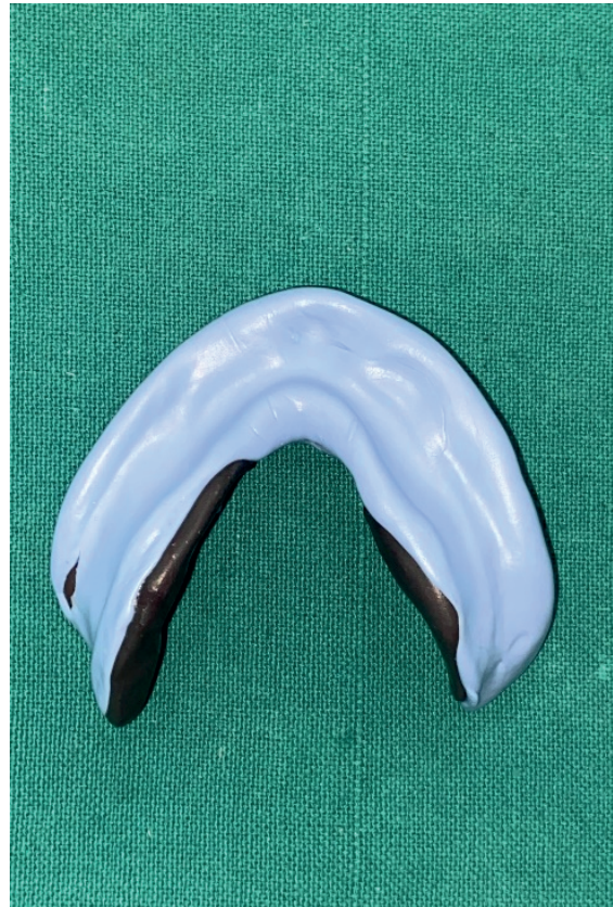
Figure 4: Impression made with polyvinyl siloxane impression material putty.

an accurate first impression [14]. A successful preliminary impression yields a well-contoured denture, an accurate wash impression, and an extended border moulding [15].