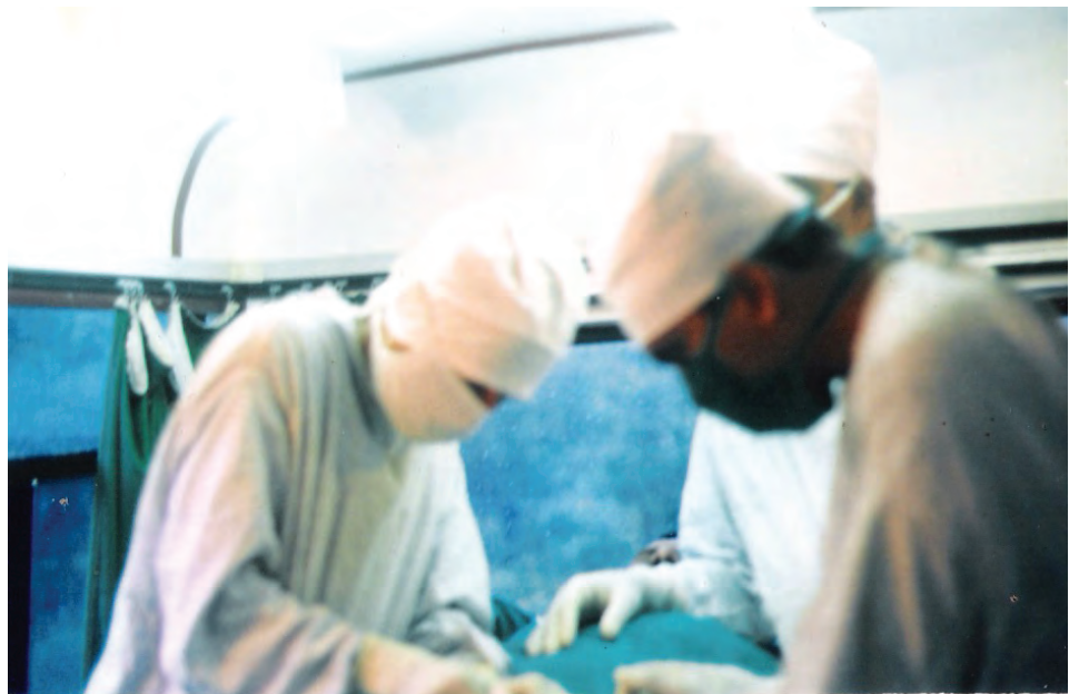
Figure 4: Surgery in progress in mobile van.

fumigated and the area around cleaned. The volunteers were briefed and their doubts cleared. Next, a list of volunteers was made and written consent was obtained after detailed pre-op and post-op instructions were given. Prepared charts of instructions were also displayed at the campsite. We aimed to perform at least 20 operations in one day. All individual volunteers were informed according to the registration list of the approximate time to report for the operation.