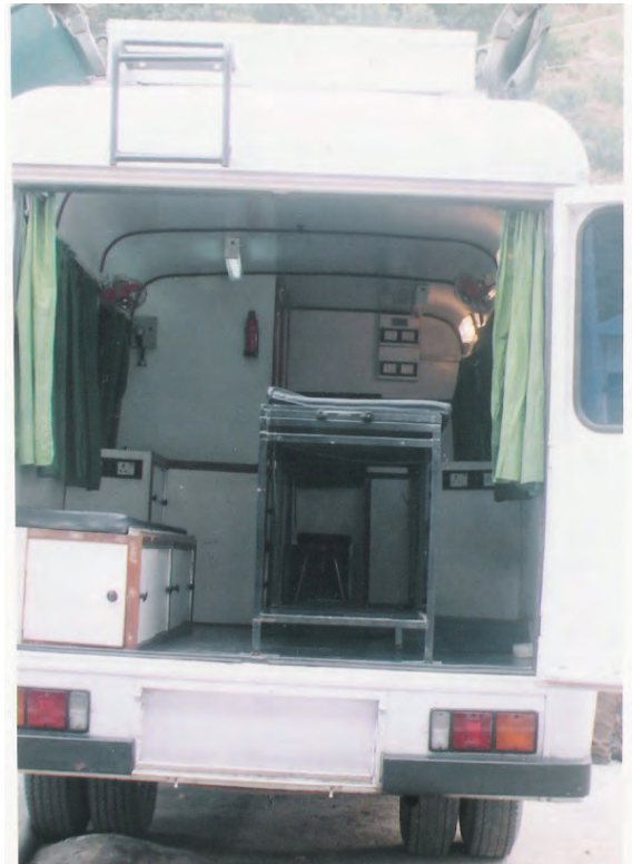
Figure 1: Mobile operating van.