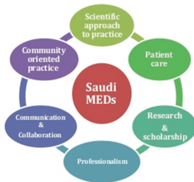
The six themes of SaudiMED

Several competency frameworks have been developed and implemented worldwide: the CanMEDS initiative in Canada; the Accreditation Council of Graduate Medical Education of the United States of America; Tomorrow's Doctors: Recommendations on Undergraduate Medical Education in the United Kingdom; the Scottish Doctor Competency Framework; Good Medical Practice; the Australian curriculum framework for junior doctors; the 2009 framework for undergraduate medical education in the Netherlands; Swedish medical education standards; the Brown University Nine Abilities, Medical School Objectives Project by AAMC; Global Minimal Essential Requirements; the European Medical Tuning Project; Dundee 12 outcomes; and the International Medical College Outcomes Malaysia [11–16]. Figures 1 and 2 show examples of these competency frameworks, focusing on the main themes around which the core competencies have been developed.