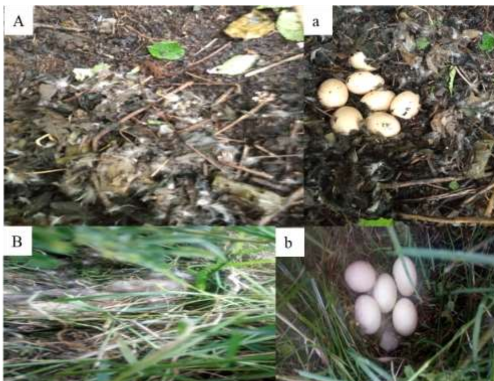
Figure 4. Nests of Yellow-billed Duck: Covered eggs (A, covered by dried leaves, feather and twigs and B, covered mainly by feathers) and Uncovered eggs (a and b) in Cheleleka wetland.

important behavioural feature observed was the mother duck moult their feathers following laying of the last egg to cover their eggs when they leave the nest for foraging. In addition to their feather, defoliated leaves, thin twigs and dried grasses were also used to cover the eggs (Fig.4 A and B).