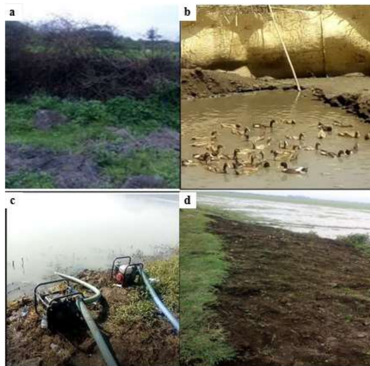
Figure 5. Threatening factors of Yellow-billed Ducks at Chelekleka wetland (a) burning of potential nesting bushes, (b) introduction of Mallards, (c) intensive irrigation and (d) farming encroachment on the fringe of Chelekleka wetland (Photo by Mebrat Teklemariam, a and b and Hailu Tilahun, c and d, 2021).

Observation during the study period revealed that burning of nesting site plants, wetland degradation due to cultivation and irrigation on the fringe of the wetland, introduction of captive Mallards ( Nasplaty rhynchos ) on the wetland margin used by Yellow-billed Duck threatens the species and also other bird species supported by the wetland (Fig. 5). There is also a potential of diseases transmission due to the introduction of captive Mallards at the out skirts of the wetland that is home to different species of birds.