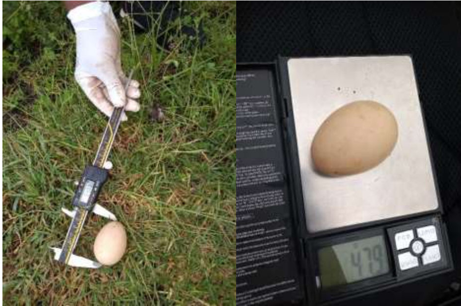
Figure 2. Measuring egg morphometries of Yellow-billed Duck in Chelekleka wetland (Photo by Mebrat Teklemariam, 2021).