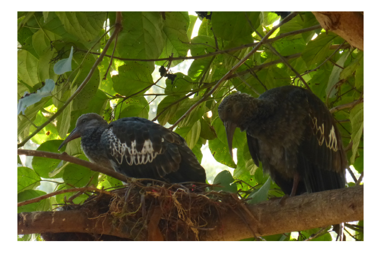
Figure 2. Two feathered chicks with white wing-patches in the second nest on 22 September 2016.

In 2017, both trees were roosting sites for two pairs of Wattled Ibises, and both started building in May, but breeding was not successful. However, on 31 August 2017, a third nest was found in the compound of the mosque in the nearby town of Bele Gesgar (2471 m), 25 km from Seru. The nest was constructed on a secondary branch of a 25-m Eucalyptus globulus tree, 12 m above the ground. Two chicks hatched and fledged successfully.