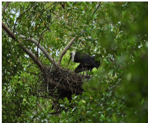
Figure 1. Nest of Woolly-necked Stork in Saadani National Park, Tanzania.

This species occurs in all months with no obvious seasonality (Table 1) suggesting that, for the most part, it can be considered resident, although individual birds in border areas presumably wander to neighbouring countries to some extent. Nesting in Tanzania is not mentioned in Brown & Britton (1980) and Dowsett & Dowsett-Lemaire (1993) could not trace any breeding records. Harvey (1972) suspected that this species was nesting close to Dar es Salaam, but was unable to prove breeding, although he watched them displaying in early December. Elliott (1973) reports this species nesting on 15 August 1948 in a baobab on the north bank of the Ruvu River southwest of Bagamoyo. This constitutes the first breeding record for Tanzania and had been overlooked by later authors. More recently, Jiri Haureljuk (pers. comm.) located a nest on 2 September 2016 in mangroves to the north of Saadani National Park close to Kijongo Bay Beach Resort (Fig. 1). On 24 January 2017 he found a further three storks in the same mangroves along the Msangasi River. There is a more or less resident flock of 20 to 30 birds in this general area.