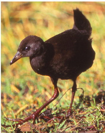
Figure 10. Juvenile with hints of grey on cheeks.

Brown siblings from the same clutch became either grey-breasted or, at a distance, sooty-black, but close to, a very dark slate (hereafter 'sooty')—a phenomenon not hitherto reported. Moulting into either was gradual, though the onset is more readily apparent with the former because grey contrasts more with the juvenile umber brown than the dark sooty. Some emerging grey feathers were detectable as early as week eight (Fig. 10), but most birds were still predominantly brown until weeks 10 to 12. By week 14 moulting was sufficiently advanced for the grey morphs to be distinct from their sooty siblings of the same clutch (Fig. 11). Fig. 12 shows the sooty colour, in Fig. 11, wing-stretching, and illustrates the degree of blackness at this age.