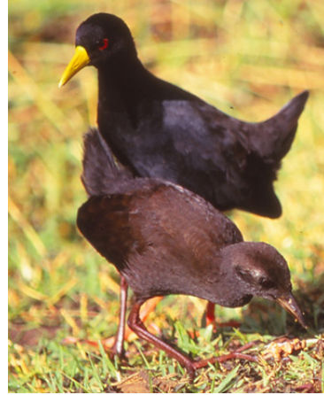
Figure 9. Bird at front in juvenile brown plumage.