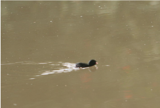
Figure 3. A Black Crake chick four days off its natal nest crossing c. 15 m of open water between clumps of riparian cover, apparently of its own volition.

New hatchlings initially stayed, not as a group, but separated in thick cover in the same general area as their nest. During this first week a hatchling usually had an older bird (juvenile, immature or adult) close by. After a week, hatchlings were left alone while all members of the family foraged. From this point on they wandered between clumps of taller vegetation around the dam's periphery, though initially spending very little time in the open intervening spaces. Rarely, they swam between these points across open water (Fig. 3).