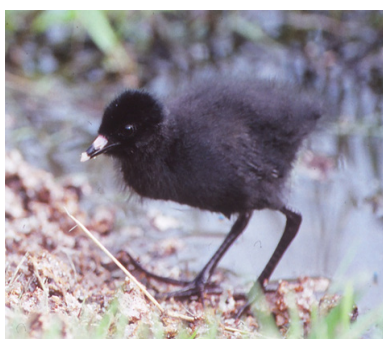
Figure 6. The bill band at c. 21 days old, remiges just appearing.