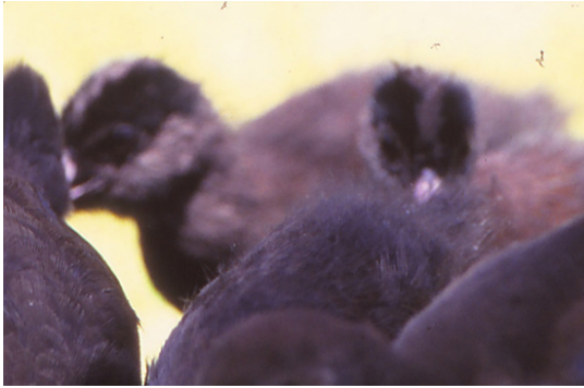
Figure 8. Among the last down to be lost is that on the head that stands up on either side of the centre line, as in the human Mohican haircut.

pale patch on the basal maxilla had shrunk to little more than an outline around each nostril, and in some to a very thin line around the base of the bill, and the bird was now wholly brown (Fig. 9).