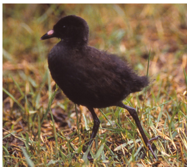
Figure 7. At c. 28 days, now no longer a downy hatchling.