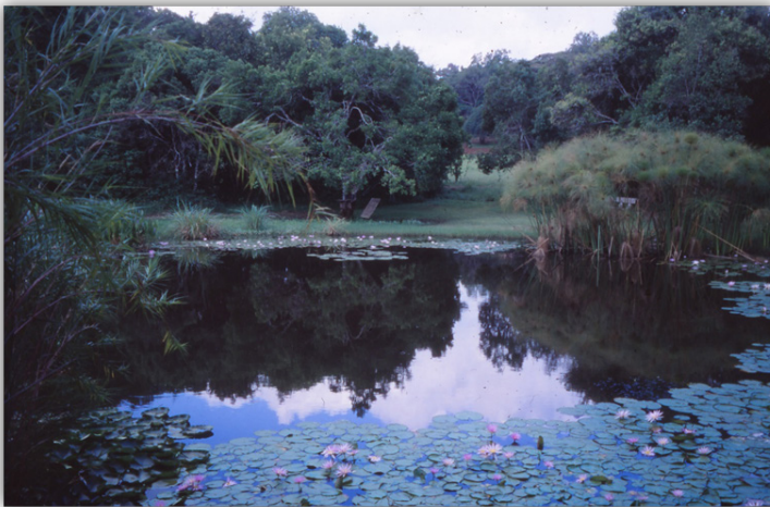
Figure 1. The dam in Nairobi's Langata suburb where Black Crake observations were made.

This selective close tolerance was exhibited only towards us, our gardener and our two dogs, but not in the same degree towards visitors. Strikingly, the appearance of a strange dog – even if it was a Jack Russel terrier as were ours – elicited loud alarm calls and a rush for cover. The lynch pin of our certitude that these records pertain to a single family derived from this founding pair was the degree of their habituation. It is improbable that a new immigrant would immediately exhibit the same selective tolerance and recognition of human individuals and two dogs. Almost as improbable was that the presence of a shy alien arriving at the dam would have escaped our notice. While colour banding would have greatly enhanced our recognition of individuals and might be essential with completely wild birds, we point out that recognizing individuals without such aids was illustrated by, among many, the late Leslie Brown's studies of raptors (e.g., Brown 1972). Such ability is routinely demonstrated by farmers dealing with massed domesticated animals.