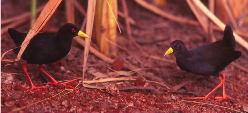
Figure 15. Left, a 'breeding' plumage, right, a black morph immature about the same age as the grey morph in Figs. 13 & 14. Is this what may have been deemed an adult 'non-breeding' plumage?

All immature sooties had disappeared from the dam before week 36, but not before some had acquired the iris, eye ring and foot colours seen in their grey-phase peers (Fig. 15).