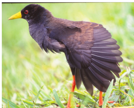
Figure 13. A grey-breasted immature, for comparison with the (slightly younger) black morph in Fig. 12.

The most obvious change in the grey morph was a distinct paling on the sides of the head and, even more, the throat (Fig.13), which should be contrasted with Fig. 10, although the bird in the latter photo is slightly younger than that in Fig. 13. This progressed until with some, but not all birds, there were flecks of white on the throat. No wholly white throats, as described by Schmitt (1975) and Urban et al. ( loc. cit. ) from crakes in southern Africa, or even the heavier white ‘splashes’ on the throat of an Ethiopian specimen in the Nairobi National Museum, were observed.