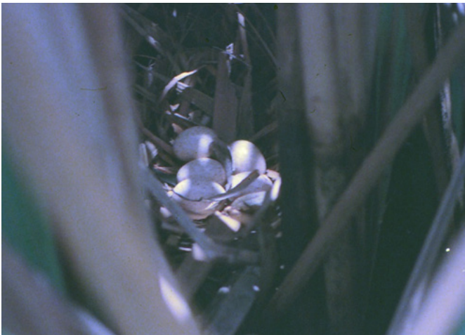
Figure 2. A typical Black Crake nest with a clutch of five eggs located in a patch of papyrus.

One breeding nest (Fig. 2) was analysed when no longer in use. It was in papyrus and made of only three materials: sections of Typha leaf, fronds from papyrus heads and bits of grass stem and leaf from Panicum repens . The dry mass weighed 250 g from which a sample of 45 g containing 169 plant parts was analysed. Extrapolated, the whole nest would have contained 939 items. Plant parts were identified to species in four length classes (<11 cm; 11–20 cm, 21–30 cm and >30 cm) as shown in Table 1. Structurally, papyrus fronds and grass contributed little to the nest, being mainly cup lining, with the bulk of the nest made from Typha leaf. All pieces >11 cm long were folded back on themselves, the longest being folded four times. All the nest materials had come from within the contiguous papyrus and Typha beds or from their edges.