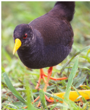
Figure 14. The same late grey morph bird in 4c displaying emerging black feathering on the side of head and how at certain angles the flank plumage can create a faint, but false, field impression of barring.

Eventually the forehead, sides of head, throat, breast and belly were a grey that was the cleanest and palest on the sides of head and throat, but less clear on the breast. Shades of grey varied somewhat between individuals. Back, wings and tail feathers became olivaceous brown. In certain lights some birds imparted a false impression of faintly barred flanks and back (Fig. 14).