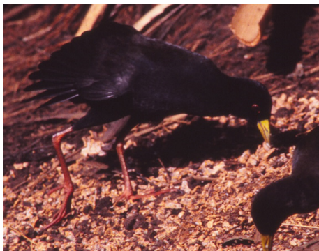
Figure 12. The bird on the right in Fig. 11 wing-stretching and emphasizing blackness.