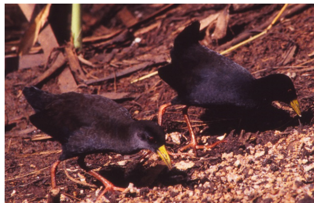
Figure 11. The two immature plumages, grey-breasted left, sooty right, from the same clutch.