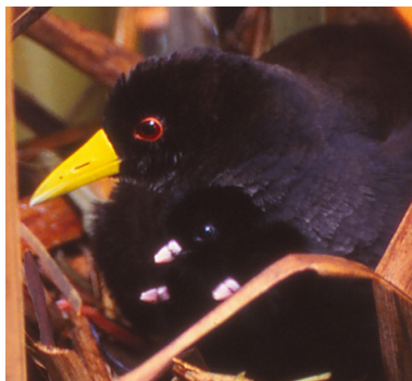
Figure 4. Three hatchlings two days old.