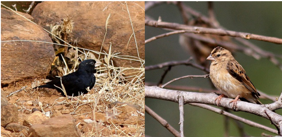
Figure 1. Male (left) and female (right) Dusky Indigobirds in the Kerio Valley, 1 March 2012.

Although Dusky Indigobird is morphologically indistinguishable from Purple Indigobird V. purpurascens (Zimmerman et al. 1996), we immediately noticed the male to be different from Village Indigobird V. chalybeata , with which we are quite familiar from elsewhere in Kenya. Prominent features observed include an ivory-coloured and heavier looking bill than in that species, as well as dull salmon-pink feet (Fig. 1). The bird also appeared slightly larger than Village Indigobird, the plumage less glossy and more blue than purple. Female-type birds which were photographed appeared identical to females of other Indigobird species, with no distinguishing field marks.