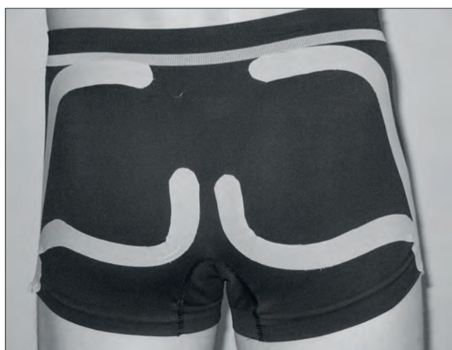
Fig. 2. Posterior view of the Y-strip KT application method (group A).

Kinesio tape was pre-cut and then individually tailored to each subject just before application. Group A's taping was applied bilaterally over the gluteus maximus muscle, as illustrated in Figs 2 and 3. The two Y-shaped pieces of taping of approximately 35 cm long and 5 cm