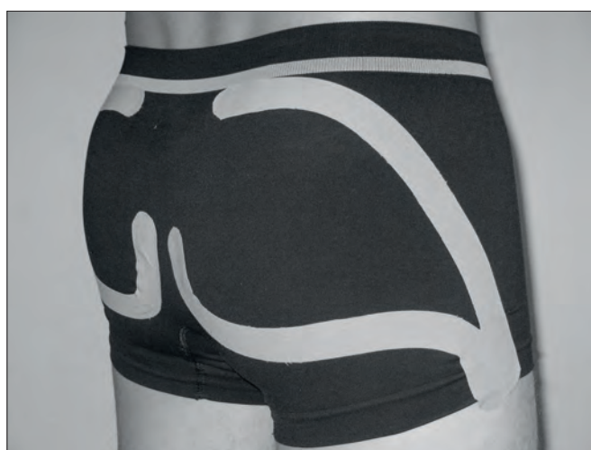
Fig. 3. Postero-lateral view of the Y-strip KT application method (group A).

wide were used. The tails of the Y were 30 cm long and 2.5 cm wide, leaving a base of 5 cm (the estimated distance between the subject's greater trochanter and fifth lumbar (L5) spinous process). Subjects were asked to lie on their sides with the hip in neutral alignment. The base of the kinesio tape was stabilised and the anterior tail nearest to the clinician was taped to the iliac crest with tape tension of between 50% and 75%. Subjects were then asked to flex, adduct and internally rotate the hip and flex the knee. The kinesio tape was stabilised and the posterior tail was attached to the sacral base, enclosing the gluteus maximus muscle, with the tape tension again between 75% and 100%.