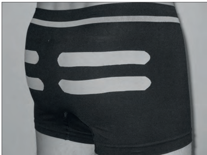
Fig. 5. Postero-lateral view of the neutral placebo KT application method (group B).

Subjects completed a standardised dynamic warm-up of 10 body-weight squats, lunge walks for 10 metres and buttock kicks for 10 metres. Thereafter each subject performed 5 CMJs at the Vertec at sub-maximal effort as training to decrease bias because of the learning effect. 27 Five practice jumps have been shown to adequately reduce the effect of learning on improvement of the outcome measure. 29