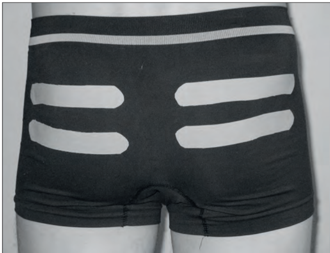
Fig. 4. Posterior view of the placebo I-strip placebo KT application method (group B).