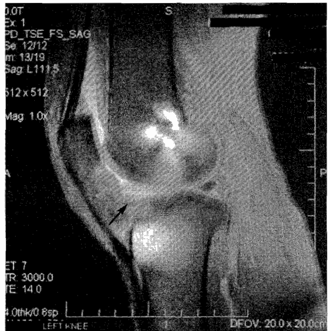
Fig. 2. Sagittal MRI knee PD fat-saturation Cyclops lesion.

space (Figs 1 and 2). The reconstructed graft was intact and no meniscal tear was present. A moderately sized effusion was present.