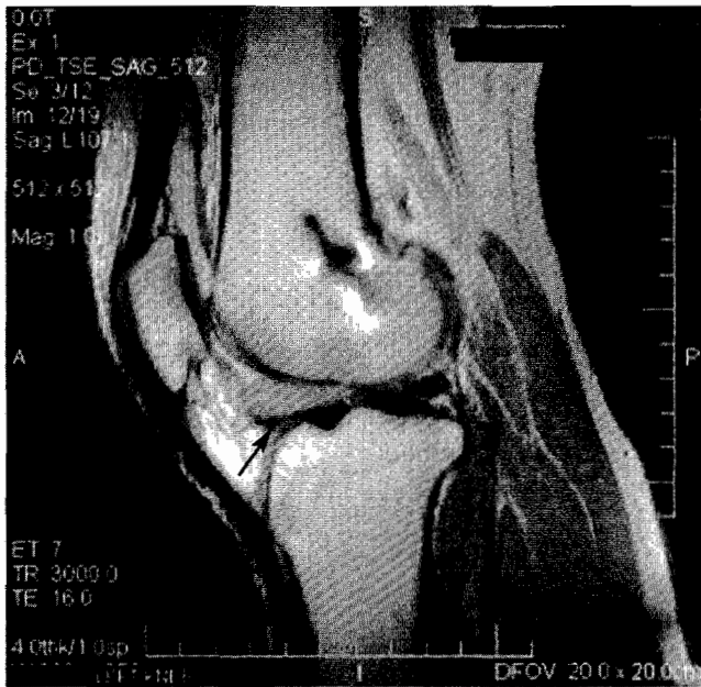
Fig. 1. Sagittal MRI knee proton-density Cyclops lesion.

Clinically there was an effusion and tenderness over the lateral joint line. Knee extension was also limited. Magnetic resonance imaging (MRI) of the left knee was requested which showed a PD (proton density) iso-intense, T2 mildly hyperintense, non-enhancing, well-circumscribed soft-tissue mass protruding anteriorly between the tibio-femoral joint-