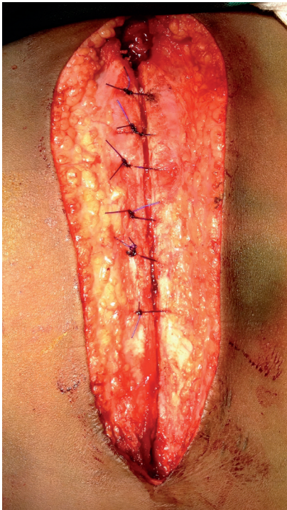
Fig. 1. The sternotomy was closed with interrupted polydioxanone sutures in all cases.