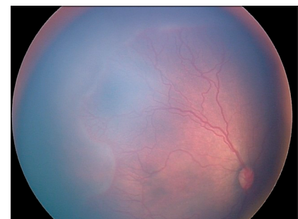
Fig. 2. Plus disease (a significant level of vascular dilation and tortuosity observed at the posterior retinal vessels).

The clinical characteristics of the infants were described as either mean values with standard deviations (SDs), or rates and percentages. These characteristics were also described within weight subgroups. Two outcome measures were used, namely the presence or absence of any ROP and the presence or absence of CSROP. In order to determine which factors were associated with the outcome measures, univariate logistic regression analysis was performed to determine an association between the outcome measures and both continuous and categorical risk factors. Unadjusted odds ratios and 95% confidence intervals were also determined for each effect. A p -value of < 0.05 was considered statistically significant. Variables found to be significant in the univariate analysis, as well as variables with known clinical relevance, were included as factors in a multivariate logistic