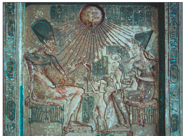
Fig. 1. Akhenaten, Nefertiti and their daughters; note their unusual appearance.

Loeys-Dietz syndrome (LDS) is an autosomal dominant inherited disorder of connective tissue that has been recently introduced as an important cause of familial aortic aneurysm. LDS is caused by heterozygous mutations in genes encoding transforming growth factor \beta receptors 1 and 2 ( TGFBR1 and TGFBR2 ). 5 Patients affected with this syndrome are characterised by specific clinical features