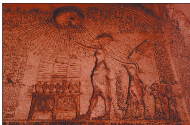
Fig. 3. Akhenaten's family worshipping Aten (the sun image).

Different syndromes and diseases have been hypothesised to explain a probable underlying disease in Akhenaten, Tutankhamun and