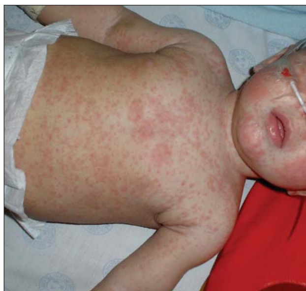
Fig. 2. Morbilliform eruption, part of the 'classic' measles dermatological presentation which included Koplik's spots, other oral manifestations such as stomatitis, conjunctivitis and a history of cephalocaudal spread of the rash.

The collected information was assessed by 7 dermatologists consisting of 1 consultant and 6 registrars. With reference to photographs of typical measles skin reactions, they assessed photographs and limited pertinent information regarding the dermatological presentation of each patient obtained at the initial assessment, and determined whether the patient displayed a morbilliform rash or not (Fig. 2). They also rated each patient according to the degree to which they conformed to the 'classic dermatological measles syndrome'. Concordance with the concept of a 'classic dermatological measles syndrome' was judged subjectively and independently by each of the observers. Observers received information regarding the presence of Koplik's spots, conjunctival manifestations, oral manifestations (stomatitis) and cephalocaudal progression of the rash. The observers were blinded to the patients' serological results. They classified the rash that they saw on photographs as morbilliform or not. They rated the patients as scoring between 0 to 10, with 0 being a patient with no characteristics of 'classic' dermatological measles, and 10 being a textbook case (as described in the introduction of this article). A score of more than 6 out of 10 was taken as a patient profile that could be considered dermatologically typical of measles. The data were analysed using Stata version 11.1 statistical software.