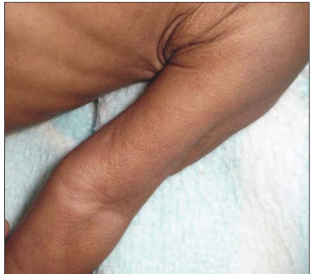
Fig. 4. One study patient with positive measles serology presented with a rash that consisted exclusively of micropapules.