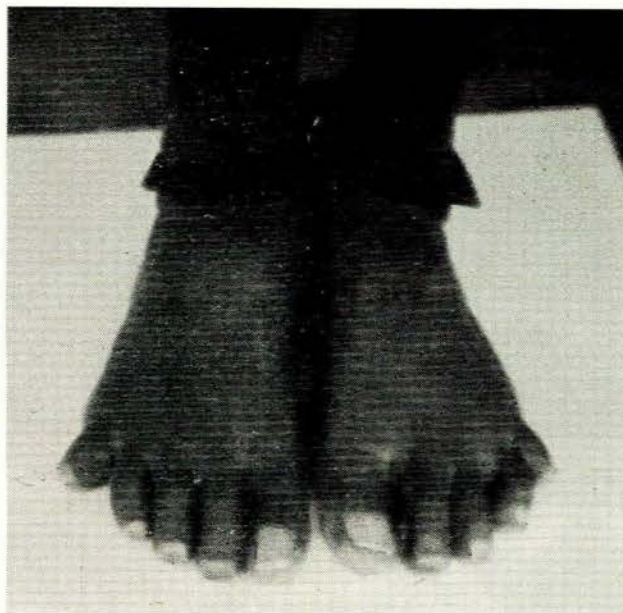
Fig. 1. Lateral deviation of the fifth toe of an affected female.

Comprehensive clinical examination failed to reveal any