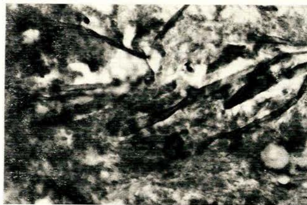
Fig. 2. Fungal elements with non-septate hyphae and branching at obtuse angles present in the necrotic tissue.

Numerous fungal elements with non-septate hyphae and branching at obtuse angles were present in the necrotic tissue and in the lumina and walls of submucosal arteries and veins (Fig. 2). Septic thrombi were present in submucosal arteries.