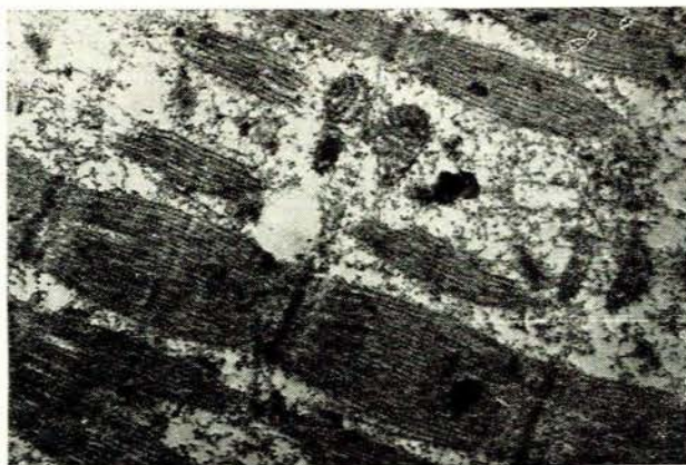
Fig. 4. Electron photomicrograph ( \times 12\,000 ) showing evidence of fibre loss and disintegration of mitochondria.