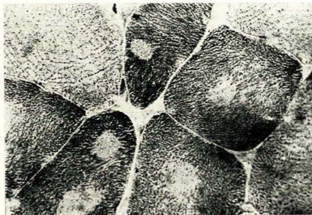
Fig. 2. NAD diaphorase preparation ( \times 400 ) showing the central cores in the type I fibres.

evidence of lymphocytic infiltration and the amount of fibrous tissue and fat within the muscle appeared to be normal. The histochemical processing showed that many of the type I fibres contained non-staining areas and these central cores were best seen in the NAD diaphorase preparations (Figs 1 and 2). In certain areas of the muscle examined there was evidence of grouping of individual fibre types. 3 Electron microscopy showed areas