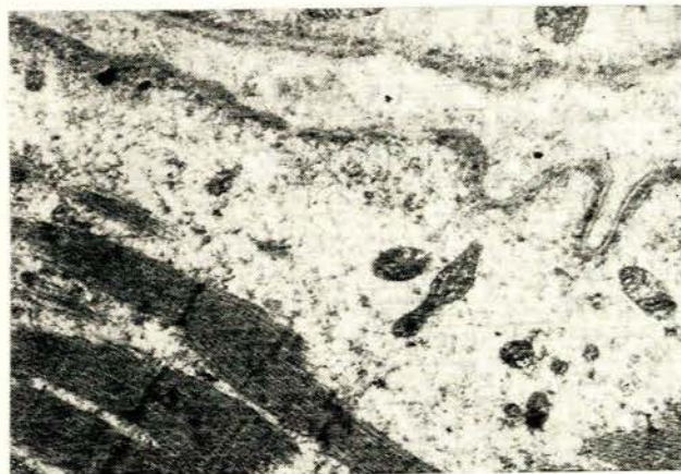
Fig. 3. Electron photomicrograph ( \times 10\,000 ) showing an area of total fibre depletion with scanty mitochondria and excessive folding of the plasma membrane.

of total myofibrillar depletion, where scanty mitochondria and excessive folding of the plasma membrane were seen (Fig. 3). Other areas showed evidence of fibre loss together with aggregations of large mitochondria, many of which were swollen and showed loss of cristae (Fig. 4). In other areas adjacent to the core region the myofibrils were closely packed, with marked zig-zagging and streaming of the Z-lines (Fig. 5). Glycogen granules were present in normal quantity.