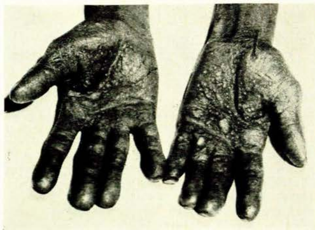
Fig. 3. Case 9. Palmar keratoses of 'marked' degree.

worked for long periods on the surface in the dust-laden atmosphere of the crushing mill, i.e. as mill 'feeders'. A fifth patient (case 16) had worked as lasher underground for 18 years in western-area mines, as well as on the surface at the roasting plant of another western mine, the