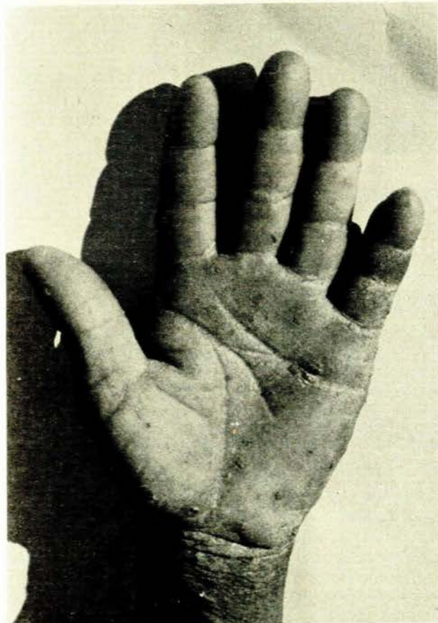
Fig. 1. Hand of patient showing palmar keratoses of 'mild' degree.

Taking these considerations into account, out of the 13 lung cancer patients with hyperkeratoses 4 (cases 4, 15, 20 and 35) had worked with a jackhammer or hammer underground in arsenical mines, and were exposed at the rock face to the maximum amount of dust in the mining environment. Two of these (cases 20 and 35) had also