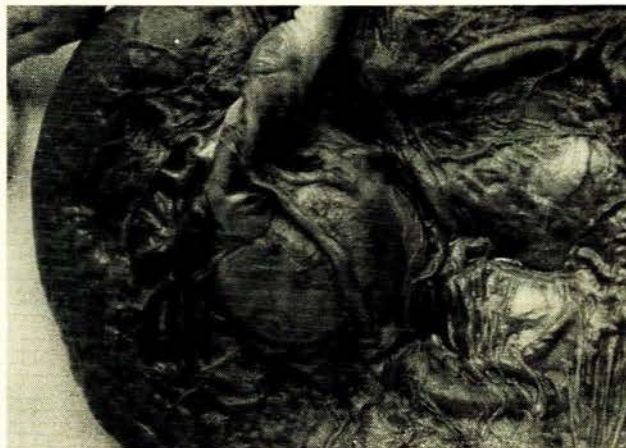
Fig. 1. Foetal surface of the placenta showing the haemangioma adjacent to and involving the umbilical cord.

Postpartum and neonatal periods for both mother and child were absolutely normal.