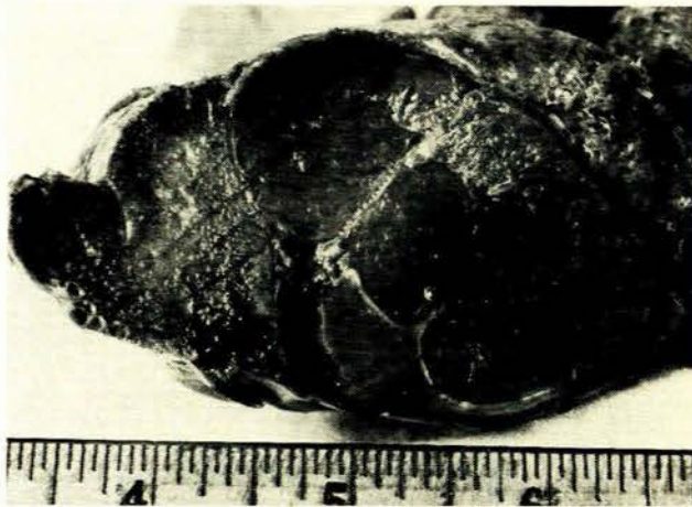
Fig. 3. Cross-section of haemangioma.

The placenta followed normally, and on the foetal surface there was a large swelling which occupied the area from the edge of the placenta to within 1-1½ inches of the insertion of the cord (Figs. 2 and 3).