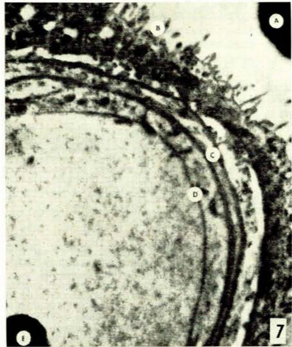
Fig. 7. Electron-microscopic study of tip of villus, at term. A = part of maternal red cell, B = brush border of syncytium, C = double layer of foetal connective tissue with fibrils between, D = endothelium of foetal capillary, E = part of foetal red cell (x 12,000).

during labour and once after that on the 10th postpartum day, when the patient was pyrexial, 3 possible causes must be considered: