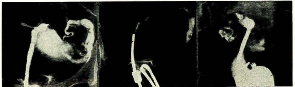
Fig. 9. Case 6. See Table I. Fig. 10. Case 6. Lateral view. Fig. 11. Case 7. Anteroposterior view.

Strassmann operation for intra-uterine synechiae. Strassmann, 16 in 1930, performed the operation per vaginam . He made a transverse incision in the fundus through which he subsequently drew the fallopian tube, severed at the isthmus but still attached to its mesosalpinx. Then, after making a long, vertical incision in the fundus and the cervix anteriorly, and by excising the synechiae he formed a tunnel through which to draw the tube, which was then secured by catgut stitches both to the cervix and the fundus. All 6 of his operations were successful in that regular menstruation was established. One woman who tried to become pregnant, successfully conceived and carried to term.