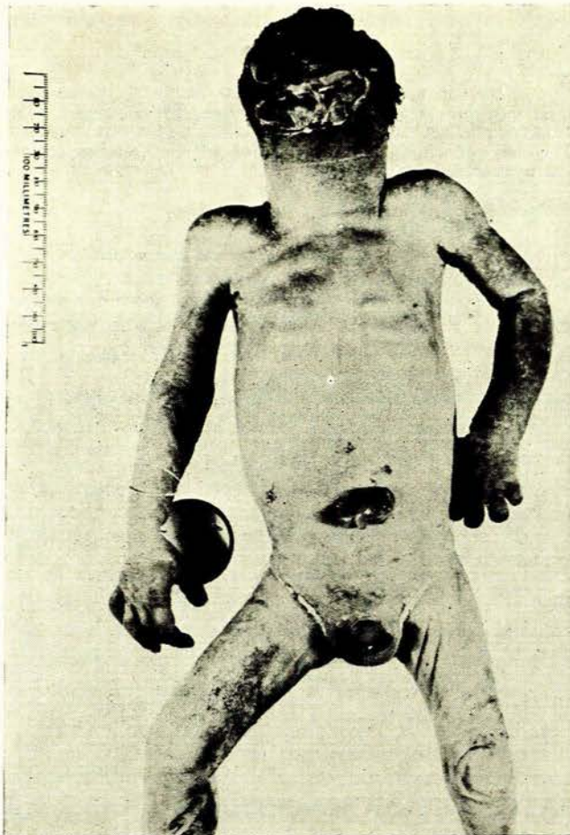
Fig. 1. Features of a case of aprosopia associated with anencephaly are shown.