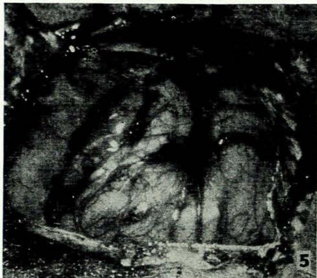
Fig. 5. The tumour as it appeared at operation.

duration of 1 year showed that he was symptom-free and had returned to school.