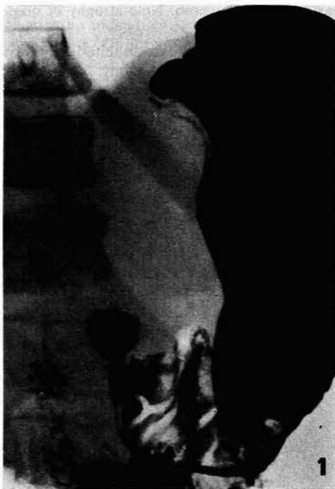
Fig. 1. See text.

Fig. 1 shows the result of a barium-meal examination of a girl aged 11 years, under investigation for the cause of upper abdominal pain. There is an indentation on the upper part of the lesser gastric curve. Is the mass in the stomach wall? What is its relation to other upper-