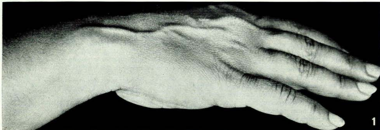
Fig. 1. Case 1. Swelling of the tendon sheath of extensor carpi ulnaris.

This paper describes the findings in 5 cases of chronic tenovaginitis of the extensor carpi ulnaris. They had all