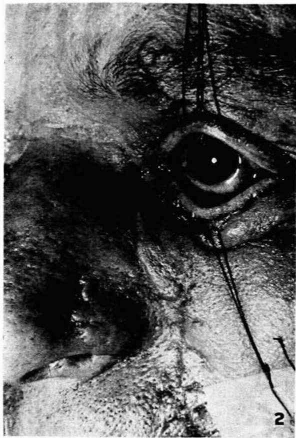
Fig. 2. The patient on his back. The facial scarring from the accident that caused the dislocation of the lens is evident. There is a marked traumatic mydriasis and the pupil is very black because the lens is lying on the retina at the posterior pole of the eye.

With the needles in position the patient was now turned on to his back again (Fig. 5). A canthotomy is again a useful procedure. The pupil is maintained in miosis if possible; pilocarpine is better for this than eserine in view of local anaesthesia.