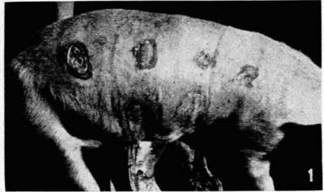
Fig. 1. Experimental animal on 9th day showing two untreated chemical burns posteriorly and two water-treated chemical burns anteriorly (experiment 1).

Oleum (acid no. 1) and concentrated nitric acid (no. 2) were applied as described above. No treatment was given. Anterior to these burns the acids were applied again, and washed off with plenty of water after 20 seconds. On the 9th day, on inspection and photography, the untreated burns appeared as 2 deep ulcers with central sloughs involving the whole thickness of the skin and subcu-