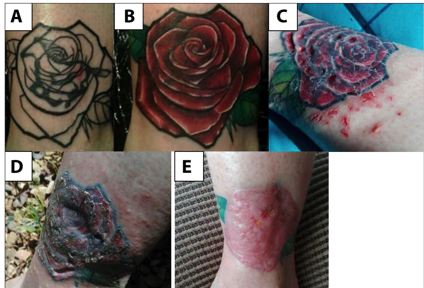
Fig. 1. (A) Original black ink tattoo outline. (B) Completed tattoo. (C) Early reaction to the red ink in the tattoo. (D) Late reaction in the tattoo, showing loss of dermal volume. (E) Final outcome of surgical excision and skin graft.

The presence of tattoos has an effect on clinical assessment, diagnostic tools and treatment modalities of many conditions. In burns, tattoos affect the histology, use of diagnostic dyes, laser Doppler imaging and magnetic resonance imaging (MRI). [51-56]