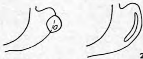
Fig. 2. Congenital gastric muscle deficiency causing (left) perforation of gastric diverticulum, (right) rupture of stomach.

Until 1943 it was believed that this condition was due to perforation of a gastric ulcer. In that year, however, Herbut 6 clearly showed that in his case a congenital deficiency of the gastric musculature, resulting in a weakness of the stomach wall, was the cause. This has been confirmed subsequently in many cases. In one case described by Vargas et al. 3 there existed a diverticulum as a result of muscle deficiency which had subsequently perforated (Fig. 2). Perforation, however,