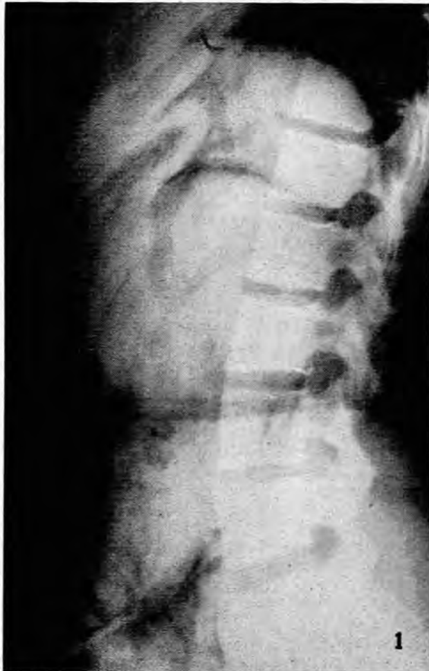
Fig. 1. Retroperitoneal gas insufflation. Lateral film demonstrating suprarenal tumour, which is depressing the kidney and pushing the stomach forwards.

Progress. During the months after operation there was a sustained improvement; at the end of the 4th month the abnormal bodily and facial hair, the acne and the 'moon face', had completely disappeared. The menstrual cycle was re-established. Steroid excretion was now normal.