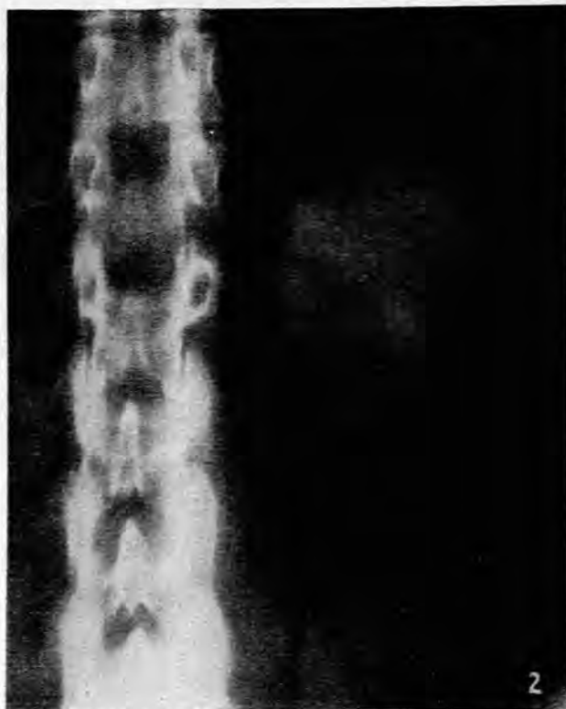
Fig. 2. Retroperitoneal gas insufflation. Supine tomographic cut showing the tumour and the kidney below it.