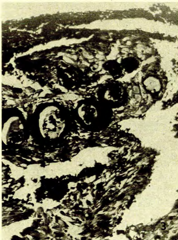
Fig. 3. See text.

Owing to the manifold difficulties in obtaining suitable material for study, Dixon and Robertson, 19 of Jamaica,