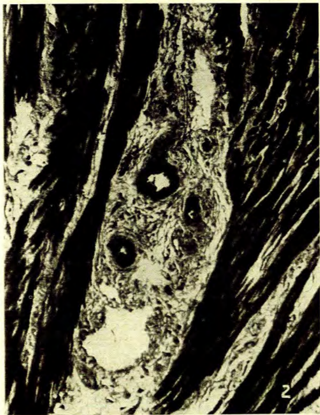
Fig. 2. See text.

In 1953 Hertig 18 stated that the pathological changes in accidental haemorrhage were decidual necrosis or degenera-