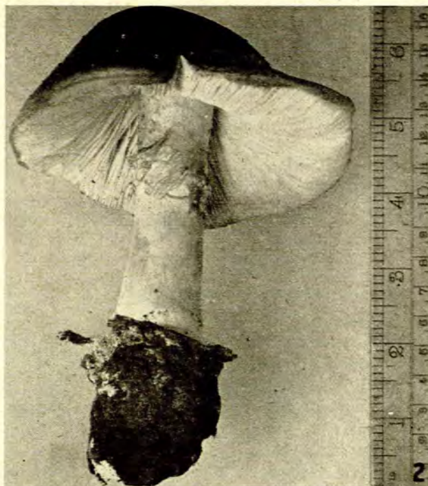
Fig. 2. Amanita phalloides (Vaill. ex Fr.) Secr.: Mature plant clearly showing the remains of the ruptured veil and vortex ('death cup'). Locality: Under oak trees on the farm Arcadia, in the immediate vicinity of Ermelo, Transvaal, where a Bantu man died from eating this mushroom.

Gastro-intestinal Tract. Areas of erosion, with haemorrhages, in the gastric mucosa. Contents of entire gastro-intestinal tract brownish in colour (changed blood).