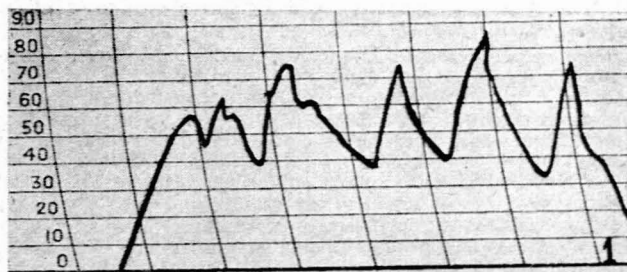
Fig. 1. Kymographic tracing showing gas passing at normal pressure but uterine contractions are rather excitable (pressure in mm. Hg).

It was decided to follow insufflation with utero-salpingography. It is interesting to note in retrospect that, had this investigation