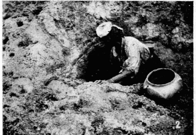
Fig. 2. Young Bapedi woman digging for water in dry river bed 5 miles from the foot of the mountain, where the river is a substantial and fast-flowing stream.

Water Supply. In spite of the plentiful water in the Lulu mountains, the Natives on the Flats suffer greatly from drought. Within half a day of substantial rainfall in