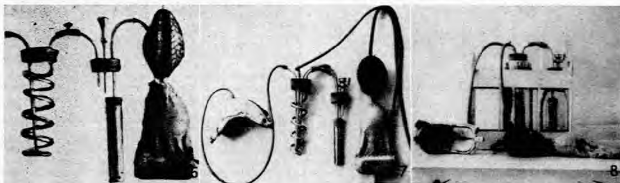
Figs. 6, 7 and 8. Daniell's modification of Shipway's endotracheal ether-oxygen apparatus.