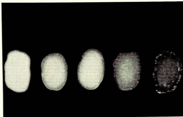
0 1+ 2+ 3+ 4+

Fig. 2 shows that reaction intensities covering the whole range were observed in the undiluted sera of each group, including the control group of general medical patients in