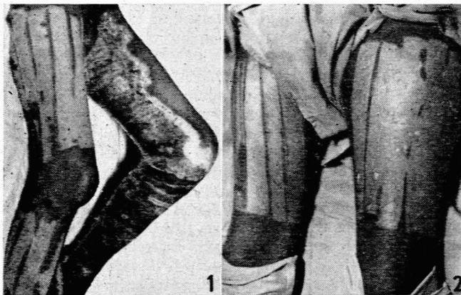
Fig. 1. Case A.B. Left leg showing area strip-grafted 7 days before, first dressing with grafts healed; donor area on right leg also healed.

Most of the urgent extensive grafts are for covering big burned areas with infected granulating surfaces, and for these