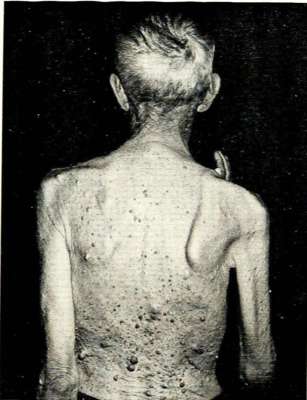
Fig. 2. Muscle wasting and winging of the scapula.

Further postoperative progress was uneventful. The Horner's syndrome disappeared in 3 weeks, with recovery of function of the right recurrent laryngeal nerve after 3 months. After 5 months there was residual paresis of the muscles of the right shoulder girdle and arm, but complete recovery of the intrinsic muscles of the hand. Wasting of the deltoid muscle with winging of the scapula (Fig. 2) remains obvious. Chest X-ray films are normal.