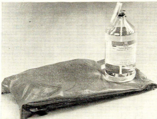
Fig. 1. Comparative size of packaged splint and 1-litre infusion bottle.

The Tauranga Thomas rescue splint 2 (the new modified Thomas splint): The Tauranga splint as originally described, came in two forms, the hospital and rescue types. It is the latter with which we are concerned. This original modification is now available in South Africa. Perhaps the most striking feature of the splint is its size. When not in use it makes up a package 42 \times 24 \times 5 cm and mass 1 kg.