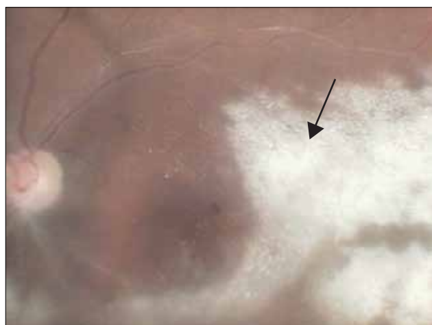
Fig. 2. Left eye fundoscopy (case 1) showing dense retinal whitening and full-thickness necrosis.

A diagnosis of CMV retinitis in the left eye and HIV retinopathy in the right eye was concluded. Weekly intravitreal ganciclovir injections into the left eye were commenced, and maintained for a total of 6 months. At 6 months post ART initiation, the patient's CD4+ cell count was 63 cells/ \mu L and his viral load was 42 copies/mL. His last ophthalmology report showed an improvement in visual acuity to 6/6 with no other pathology in the right eye. No visual improvement was noted in the left eye; visual acuity remained static at 3/60. The patient remained clinically stable otherwise.