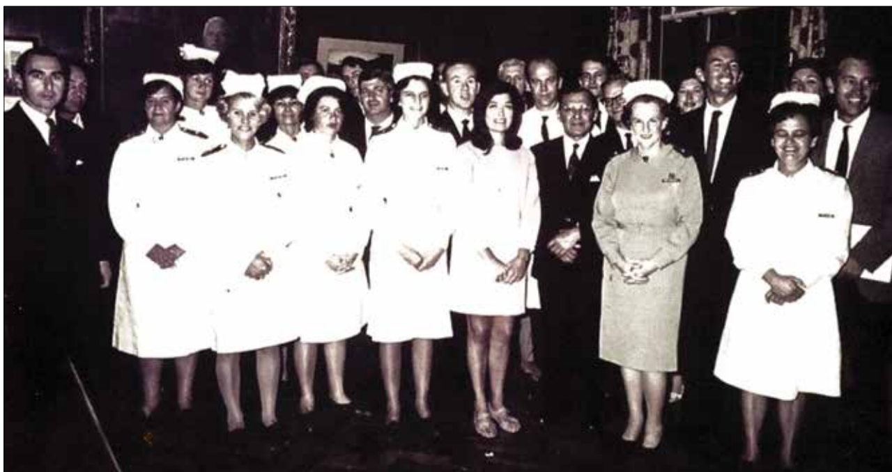
Some of the members of the team that performed the first heart transplant, photographed on 3 December 1967. The full team is listed on p. 1037 of this issue.

S Afr Med J 2017;107(12):1035-1036. DOI:10.7196/SAMJ.2017.v107i12.12960