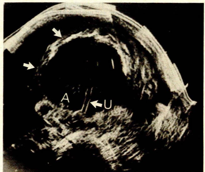
Fig. 2. Transverse scan through the fetal trunk showing ascites (A), the umbilical vein (U), more clearly seen than usual within the abdominal cavity because of the ascites, and oedema (arrowed).