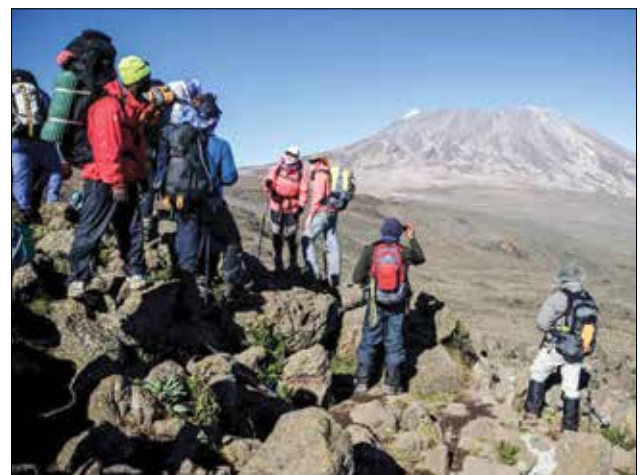
Fig. 1. Despite reduced temperatures at high altitudes, the increased solar radiation and physical exertion can lead to severe sunburn and heat stroke in the unwary.

Risk factors traditionally considered to increase our susceptibility to the deleterious effects of heat stress include obesity, lack of acclimatisation to hot environments, poor physical fitness, extremes of age, underlying illness (e.g. cardiac conditions, hyperthyroidism), dehydration, certain medications (e.g. beta blockers, anticholinergics,