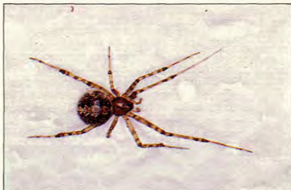
FIG. 7. A Theridion spider species, known as the comb-footed house spider or false button (widow) spider. Note the median notched pattern on the dorsal surface of the abdomen, ranging in colour from grey to dull red.

The venom of the Latrodectus and Steatoda spider species contains a 120 - 130 kDa protein neurotoxin known as \alpha -latrotoxin which binds with high affinity to a specific presynaptic receptor ( M_r 200 000), creating ionic pores and setting a process in motion resulting in a massive release of neurotransmitters. It displays no selectivity for specific types of synapses, has no effect on non-neuronal cell types, whether excitable or not, and is devoid of any detectable enzymatic activity. 18-21 The massive release of the two main peripheral neurotransmitters, acetylcholine and noradrenaline, accounts for the entire clinical picture of latrodectism. A bite, especially by the more venomous L. indistinctus , induces a hyperactive state, initially characterised by a generalised stimulation of the somatic and autonomic nerve endings; this is followed by a phase of relative paralysis due to the depletion of neurotransmitters. The central nervous system is not affected owing to the apparent inability of the toxin to cross the blood-brain barrier.