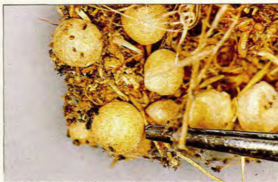
FIG. 3. Egg sacs of black widow spider.

L. geometricus is a slightly smaller and less robust-looking spider than L. indistinctus . The colour varies from creamy-yellow or greyish brown to dark brown. The dorsal surface of the abdomen displays an intricate pattern of well-demarcated geometric markings, ranging in colour from cream to brown to orange (Fig. 4). These patterns are less pronounced and almost absent in the darker specimens. L. geometricus is characterised by a consistent orange to red hourglass mark on the ventral surface of the abdomen (Fig. 5). The joints of the legs are darker and impart a banded light to dark brown appearance to the legs. The egg sacs can easily be distinguished from those of L. indistinctus by the numerous spicule-like projections distributed over the surface (Fig. 4). The webs of this cosmopolitan species are commonly found around homes throughout the RSA. They have a predilection for window sills, drain pipes, garden furniture, garden sheds, post boxes, barns, stables and outdoor toilets. 2,8-15