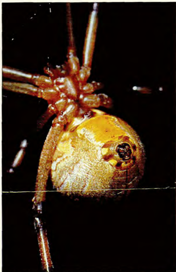
FIG. 5. Brown widow spider ( L. geometricus ). Note the orange hourglass mark on the ventral surface of the abdomen.