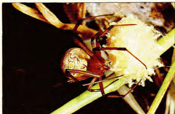
FIG. 4. Brown widow (button) spider ( L. geometricus ) with egg sac. The dorsal surface of the abdomen displays a pattern of well-demarcated, geometric markings.

L. geometricus is a slightly smaller and less robust-looking spider than L. indistinctus . The colour varies from creamy-yellow or greyish brown to dark brown. The dorsal surface of the abdomen displays an intricate pattern of well-demarcated geometric markings, ranging in colour from cream to brown to orange (Fig. 4). These patterns are less pronounced and almost absent in the darker specimens. L. geometricus is characterised by a consistent orange to red hourglass mark on the ventral surface of the abdomen (Fig. 5). The joints of the legs are darker and impart a banded light to dark brown appearance to the legs. The egg sacs can easily be distinguished from those of L. indistinctus by the numerous spicule-like projections distributed over the surface (Fig. 4). The webs of this cosmopolitan species are commonly found around homes throughout the RSA. They have a predilection for window sills, drain pipes, garden furniture, garden sheds, post boxes, barns, stables and outdoor toilets. 2,8-15