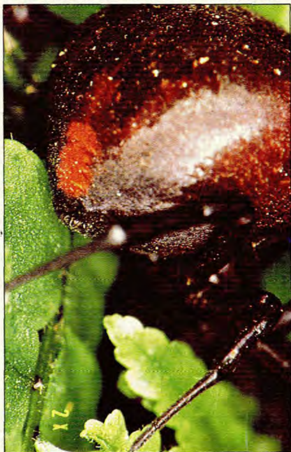
FIG. 2. Black widow (button) spider ( L. indistinctus ) demonstrating a red, median stripe on posterior end of dorsal surface. The stripe diminishes with age until only a red spot remains above the spinnerets.

L. indistinctus is a pitch-black or dark brown spider with an average body length of 12 - 15 mm. Young specimens have a prominent median red stripe or transverse red stripes on the middle to posterior third of the dorsal aspect of the abdomen. These stripes diminish with age until only a red spot remains above the spinnerets (Fig. 2). In some specimens the red spot fades and may disappear completely. Most adult females have irregularly distributed white to yellowish spots or speckles dorsally on the abdomen. There are no ventral markings on the abdomen. The legs are evenly black in colour and the third pair is typically shorter than the rest. The globular or pear-shaped egg sacs, which measure 10 - 15 mm in diameter, are white to greyish yellow in colour with a smooth silky surface 10 (Fig. 3). Although L. indistinctus is occasionally found in suburban gardens and bites have occurred inside the home, it is predominantly a veld species. The nests are constructed at the base of small bushes, shrubs, tufts of grass or stubble or among heaps of loose debris such as plankton, sheets of corrugated iron and hessian bags. The great strength of the individual strands of silk is a distinctive feature of the webs of the Latrodectus genus. 2,8-15