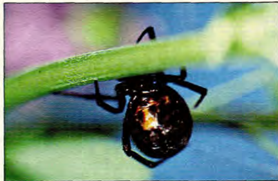
FIG. 6. S. foravae . The Steatoda spider species are also known as the false widow (button) or cob-web spiders. Note the beige to light-brown hourglass-shaped mark on the ventral surface.

shorter than the body length. No reliable documentation with regard to its toxicity exists. 9