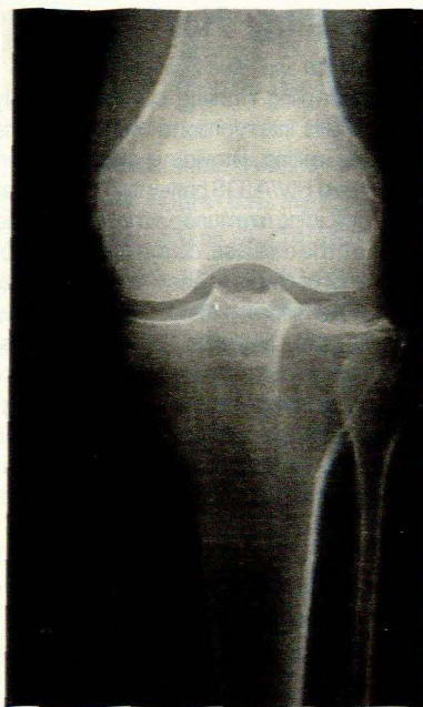
Fig. 1. Radiograph of the left knee showing a lytic lesion involving the lateral aspect of the tibial plateau.

In November 1998 he was admitted to his local hospital with a 1-year history of constipation, and was found to have faecal impaction. A barium enema was normal and he was treated with laxatives. He also complained of 3 - 4 months of pain in the left knee. A radiograph of the knee revealed a lytic lesion of the tibial plateau (Fig. 1) and a serum calcium level was found to be 3.63 mmol/l (normal 2.1 - 2.6 mmol/l). The urea level was 11 mmol/l and the creatinine level 319 \mu mol/l. A diagnosis of metastatic prostatic carcinoma resulting in hypercalcaemia was considered, but thought to be unlikely as the tibial lesion was lytic rather than sclerotic. The patient was therefore referred to us with possible primary hyperparathyroidism.