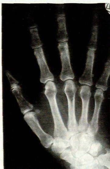
Fig. 2. Radiograph of the left hand showing subperiosteal resorption and lesions compatible with brown tumours involving the third metacarpal and proximal phalanx, and the proximal phalanx of the thumb.

Assessment of thyroid function and the hypothalamo-pituitary-gonadal axis demonstrated evidence of sick euthyroid and sick gonadotroph syndromes, with normal prolactin and gastrin levels. The radiograph of his knee revealed a lytic lesion involving the lateral aspect of the left tibial plateau as well as smaller lesions involving the distal femoral shaft and proximal fibular shaft (Fig. 1). Diffuse osteopenia was evident on the skull radiograph and the chest radiograph revealed normal heart and lungs. A radiograph of his hands showed subperiosteal resorption and lesions compatible with brown tumours involving the left third metacarpal and proximal phalanx, and the proximal phalanx of the left thumb (Fig. 2). A whole-body Tc99m MDP bone scan revealed a 'super' bone scan compatible with a metabolic disorder together with areas of increased uptake involving the left lateral tibial plateau as well as the hands, ribs, pelvis and left femur.