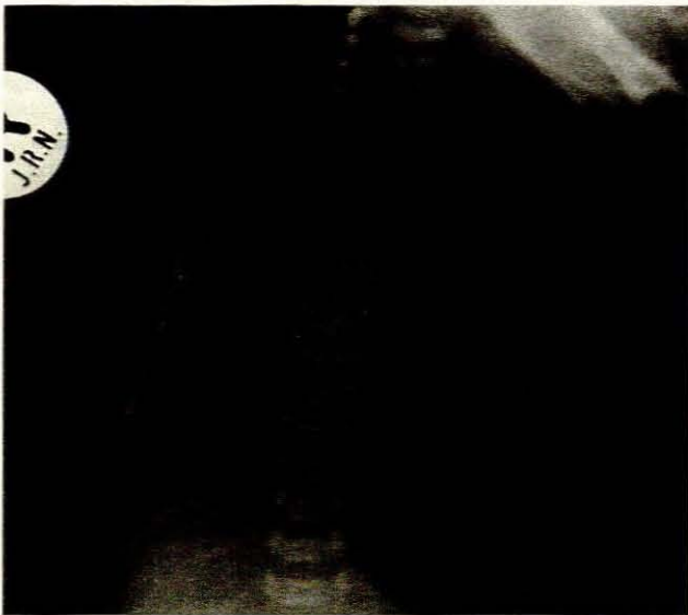
Fig. 4. The radiographic appearance of the chest with the neck rotated to the left. Crowding of the ribs is present on the left, the side to which the head is turned.