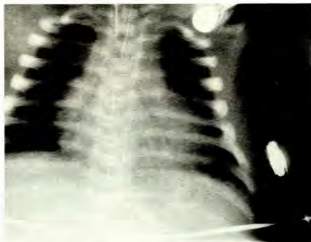
Fig. 1. Admission chest radiograph showing a bilateral streaky infiltrative pattern with opacification of the right upper lung lobe with associated air bronchogram. The cardiothoracic index is increased.

clinical course was complicated by severe PPHN and status epilepticus. The PPHN was confirmed by two-dimensional echocardiography which showed right-to-left shunting across the ductus arteriosus, tricuspid insufficiency and an estimated pulmonary artery systolic pressure of 48 mmHg. The pulmonary arterial hypertension initially responded to hyperventilation-induced alkalosis. No tolazoline or exogenous surfactant was administered. Further treatment included penicillin, dopamine, intravascular volume expansion and a continuous bicarbonate infusion. The ventilatory course of the patient is depicted in Fig. 2. The ventilation index (VI1), the product of ventilator respiratory rate and peak inspiratory pressure partly reflects severe respiratory compromise ( VI1 > 1\ 000 ) and our approach to ventilation in some patients with PPHN, i.e. hyperventilation (higher VI1) to induce an alkalosis in an attempt to reduce pulmonary vascular resistance with subsequent improvement in oxygenation (higher a/APO_2 ratios). In Fig. 2, the effect of this approach on oxygenation is most evident at 18 hours of age. Despite attempts to stabilise the infant,