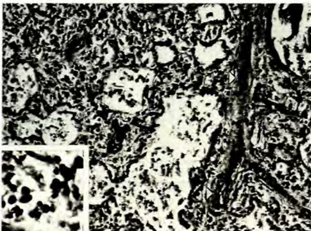
Fig. 3. The inter-alveolar septa are infiltrated by numerous macrophages, lymphocytes and plasma cells (inset) with associated fibroblasts and delicate fibrosis. Note the muscularisation of an intra-acinar arteriole (arrows)

Autopsy showed lungs of normal macroscopic size. There was a slightly increased combined lung mass of 46,5 g. Histopathological examination of lung sections (Fig. 3) revealed pulmonary oedema, intra-alveolar haemorrhages, localised bronchopneumonia and a marked interstitial infiltrate of lymphocytes, plasma cells and macrophages associated with fibroblast proliferation and mild interstitial fibrosis. Close examination of the peripheral pulmonary arterioles within the inter-alveolar septa showed focal muscularisation with associated increased adventitial connective tissue. These changes were observed in numerous sections representative of all the lung lobes. Meconium aspiration, intravascular thrombi and abnormalities of the pulmonary veins were absent. No evidence of obliterative fibrosis as described in 'pneumonia alba' was present.