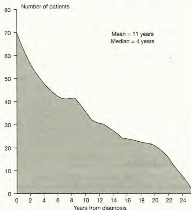
Fig. 3. Duration of follow-up from diagnosis to last visit (all patients).

The duration of follow-up of all 70 patients is shown in Fig. 3. Nine were lost to follow-up after 1, 1, 10, 10, 10, 12, 21, 23 and 24 years (mean 11 years) respectively, while of the remainder 14 have died. The cause of death is unknown in 5 patients, and 1 died of ischaemic heart disease. The remaining 8 patients (57%) died of FAP: 6 of carcinoma of the large bowel (present at diagnosis in 5), 1 patient of cancer of the duodenum and the other of a desmoid that caused perforation of the small bowel. Gastroscopy with an end-viewing instrument in 18 patients identified