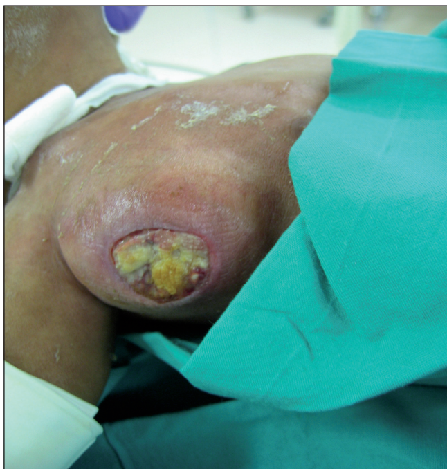
Fig. 2. Axillary BCG lymphadenitis with ulceration.

The average time from starting HAART to the onset of symptoms was 1.4 months. Nine of the 15 infants were placed on TB treatment. A total of 22 interventions were performed