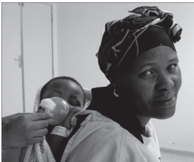
Fig. 1. Parental presence at induction, previously considered impossible, is now common practice in many institutions. Innovative methods can reduce anxiety at induction.

toys or other 'security blankets' are welcomed. Pungent odours of some anaesthetic vapours can be disguised by flavoured facemasks that are now produced in a variety of colours. Sevoflurane, even in high concentrations, is more pleasant, faster acting and has an odour that is more easily disguised than halothane or ether.