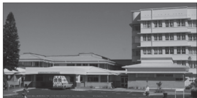
Fig. 2. The new Trauma Unit at Red Cross Children's Hospital.

With great help from the Red Cross Hospital Trust R17 million was fundraised within a record time, and the unit was opened in October 2004. The new unit consists of a vastly modernised resuscitation room, including digital radiological equipment, two state-of-the-art modern operating theatres