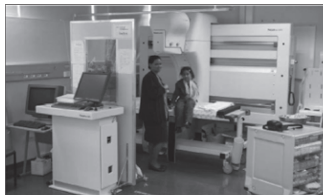
Fig. 3. The digital whole-body imaging device (Lodox StatScan) in the resuscitation room.